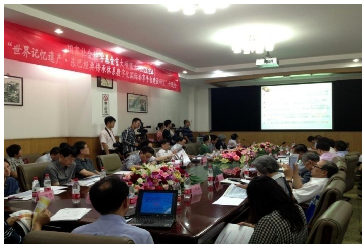
Meeting site

The morning of June 22, 2013, the National Social Science Fund Key Project report of feasibility study meeting was held in Beijing Information Science and Technology University. The anthropology, Ethnology Experts and scholars and project group members of nearly a hundred people attended the meeting.