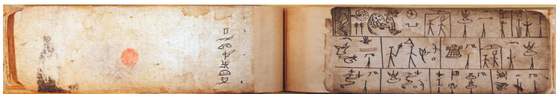
The one page of the Dongba manuscripts collections in the French National Library (Bibliotèque Nationale de France) Its library collection of Dongba manuscripts digital versions have been provided free of charge to the China National Social Science Fund Key Project in 2013