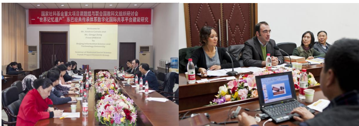
Project Team had a meeting with UNESCO Office Beijing in January 2013